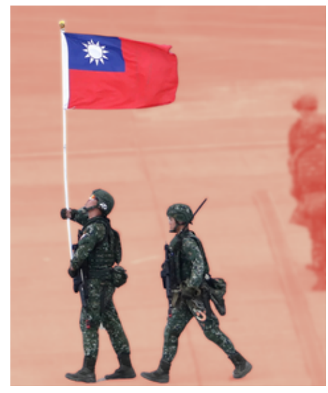
Wednesday 27th November 2024

Israel is still focused on destroying Hamas (a listed terror organization) and recently Benjamin Netanyahu has stated the IDF and relief efforts have catered for the citizens of Gaza.