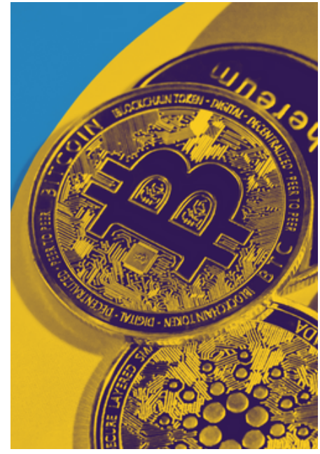
Friday 30th November, 2024

Crypto soared on the night of the election, and set off a bull run for the remainder of the month, driven by market expectations of the incoming trump administration "crypto-friendly" and less likely to impose harsh regulation. Individual investors and Bitcoin (BTC) reached new all time highs of $153,371 (AUD) on the 22nd of November, with other coins such as Ethereum (ETH) making 38% gains from over the month. The market itself surging 40% since November 5th. The commodities market on the other hand has been hit hard with Oil, Gold, Silver trading lower, likely due to the election and trumps commitment for world peace and stability, relieving upwards pressure. due to the erratic and unpredictable nature of the incoming Trump Administration, we will have to wait a few months to see where the markets move next.